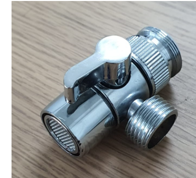
2 Way Faucet Adapter

Connect dishwasher water hose to Sink Tap using the adapter